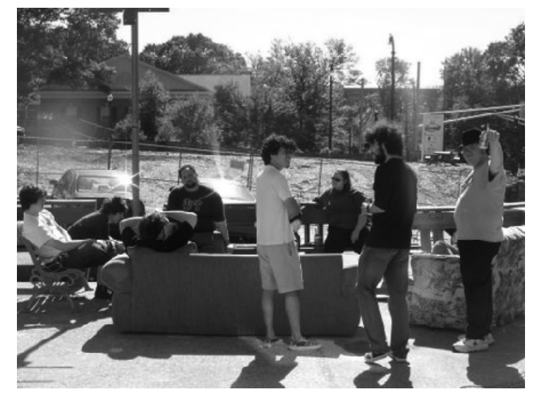
Homecoming was a huge success with alum, actives, and neophytes all getting together for some fun in the sun